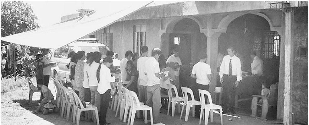
Combined Service Tabuk Community