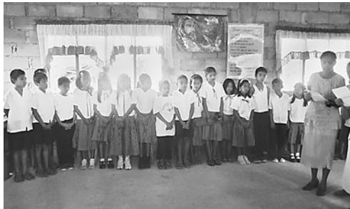
Children at Bila-Bila