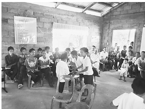
Children in groups test on the Bible