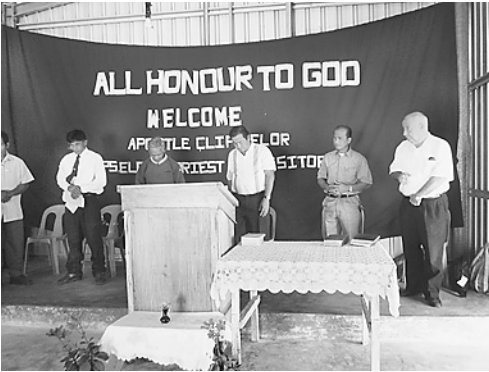
Service in Duclogan