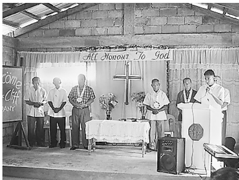
Service at Bila-Bila