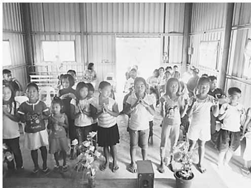
Children at Naguillan