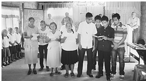
Choir at Bila-Bila