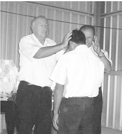
Blessing on an Officer