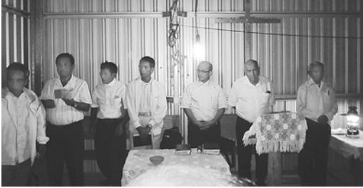
Service at Kilong-Olao (night by lamp)