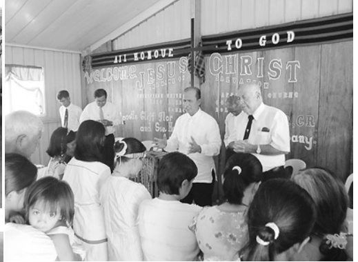
Members for Sealing