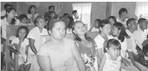
Service at Bao-yan