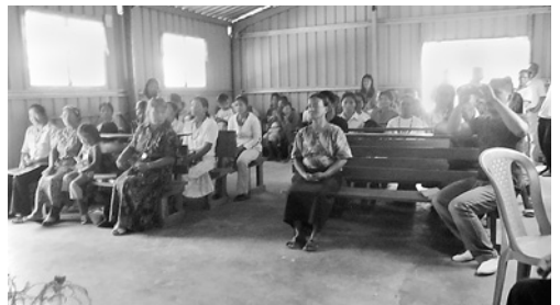
Service at Amti